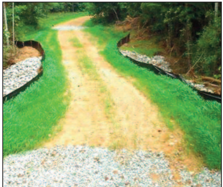
Corrective actions following harvesting activities protect your land from erosion and damage from log trucks.