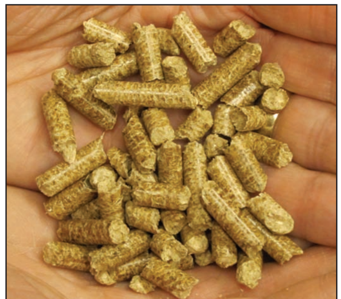
These pellets were made from woody biomass that is formed into an easily transported fuel for utilities or even special home heating stoves.