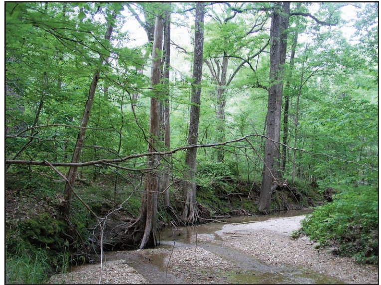
Riparian areas prove to be a valuable habitat for a wide variety of game and non-game species.

Burning – Low-intensity prescribed burning, done on a 3 to 5 year cycle, keeps brush, briars and saplings in the understory from becoming an impenetrable thicket. It also encourages grasses, forbs and legumes to germinate and grow.