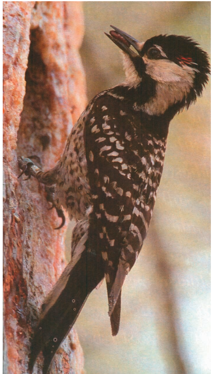
The red cockaded woodpecker is a federally listed endangered species that in Louisiana is mainly found on nation forestland.