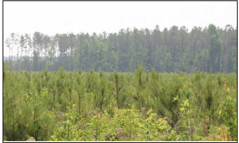
Proper planning prior to reforestation can ensure a healthy and productive forest in the future.

Louisiana Forestry Association can assist with contacting private/industrial firms with cost sharing or landowner assistance programs, http://www.laforestry.com/site/Home.aspx .