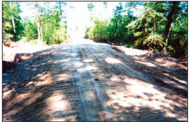
Culverts and road building are part of the BMP guidelines found in the Louisiana Recommended BMP manual.