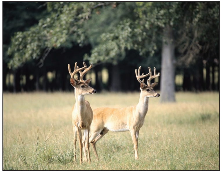
Game species are a big consideration for landowners who want to hunt on their own land or derive the income from a lease.