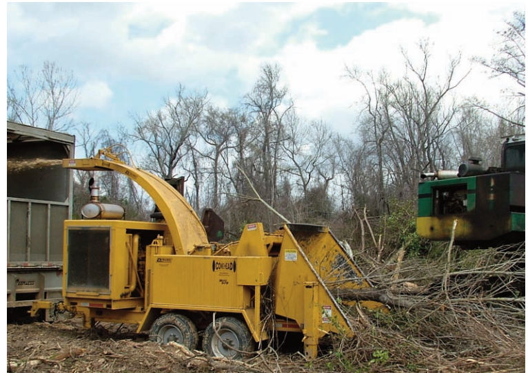
An in-woods chipping operation can add income from forest biomass.